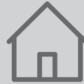
RESIDENTS BUY THEIR HOMES

It is an ideal housing solution for active adults who are looking to maintain and build equity while freeing up money for life's other priorities, or to enter the homeownership market and start building equity, without the price tag and required down payment of a freehold home.