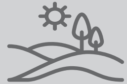
THEY LEASE THE LAND

An affordable way of owning your home with: